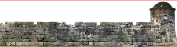
Fuertes de Bocachica – Lienzo de Murallas of Cartagena – PEMP of Bocachica

Preliminary studies, comprehensive restoration project and execution of works. Public Improvement Society of Cartagena de Indias.