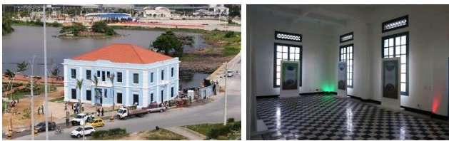
River Administration Building of Barranquilla (2014)

Preliminary studies, comprehensive restoration project and execution of works. Center of Cartagena, Plaza Santo Domingo. Client: Instituto Nacional de Vías- Ministerio de Cultura. 1998.