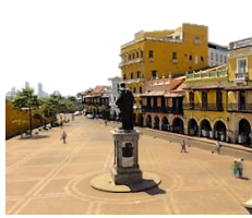
Plaza de los Coches