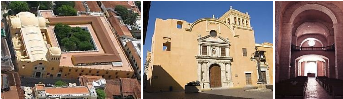
Church and Cloister of Santo Domingo – National Architecture Award XX Architecture Colombian Biennale Category Restoration

Restoration project and studies. Historic Center of Cartagena, San Diego, Calle de La Moneda. 1996.