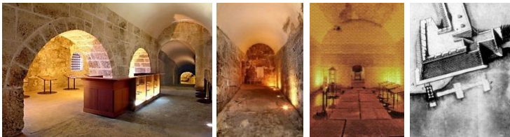
Bastion of Santa Catalina– Honorable Mention XIX Colombian Biennale of Architecture, Restoration Category (2004).

Consoiciado Architect - Site Manager. Intendencia Regional Consortium. Recovery, revitalization and restoration of an old building that housed the administrative offices of the River Administration since the late 20s of last century. Barranquilla.