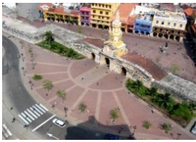
Plaza de la Paz