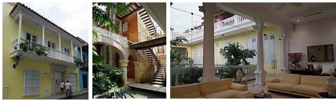
Casa Mattos (2014) – Historic Center– Cartagena de Indias

Coauthor recovering Public Spaces of the Historic Center of Cartagena de Indias. 1994 -1997