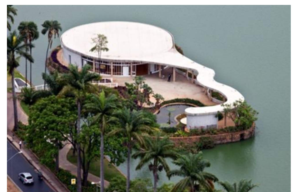
Reference Center of Urbanism, Architecture and Design Former Ball Room (Casa do Baile)