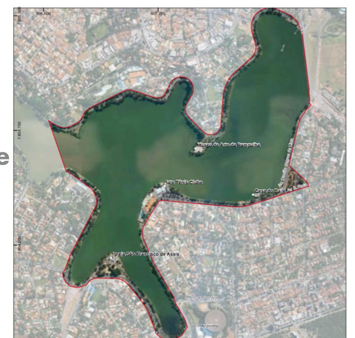
Pampulha Modern Ensemble - Aerial View - Core Zone