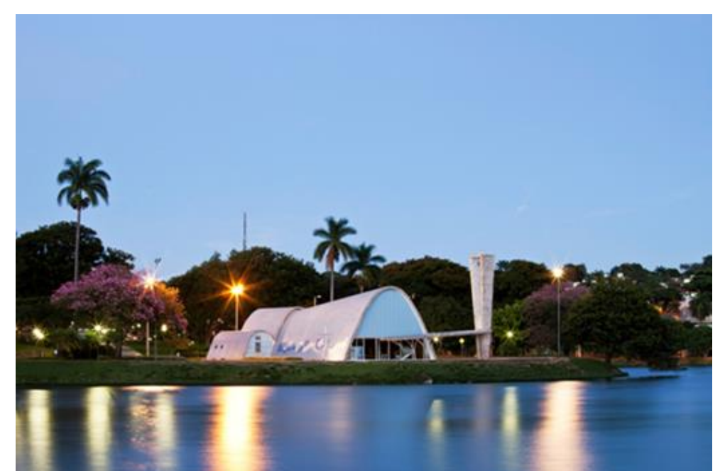
São Francisco de Assis Church