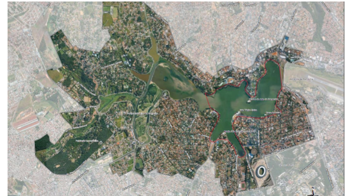
Pampulha Modern Ensemble - Aerial View - Buffer Zone and Core Zone

Source: PRAXIS, Map, Nomination Dossier of The Pampulha Modern Ensemble, 2016.