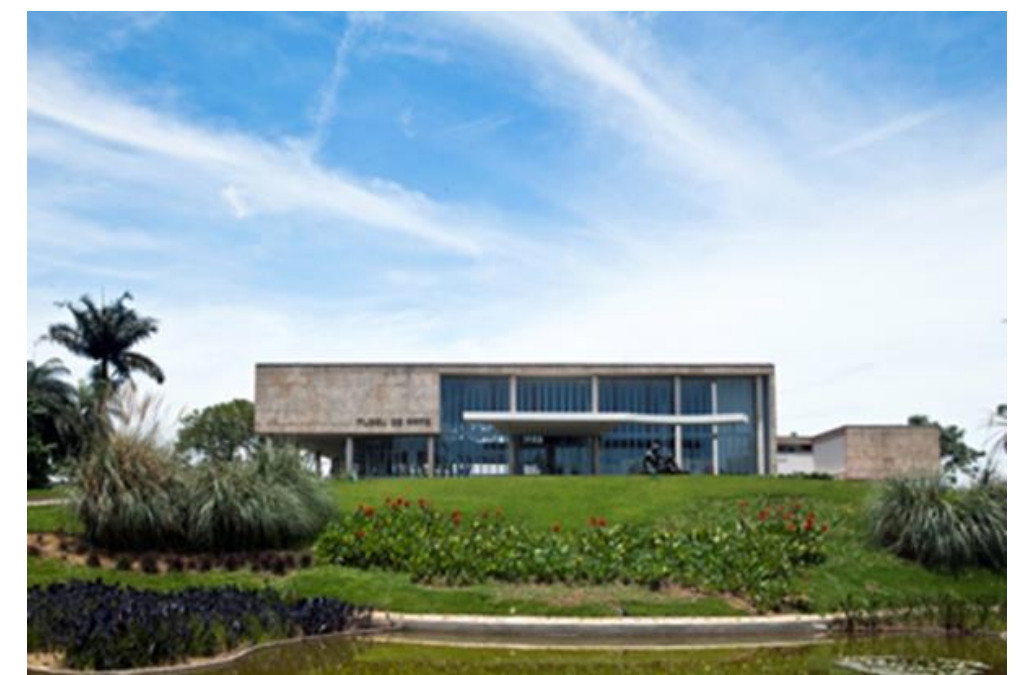
Pampulha Art Museum Former Casino